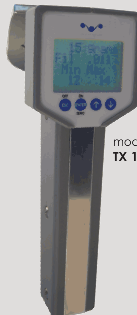
model shown TX 125